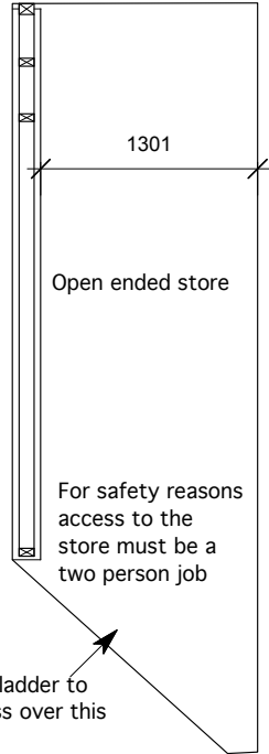
Plan of gallery storeroom

WC compartment of heavy framed construction with acoustic sealed door